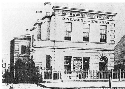
FIG. 1. The Melbourne Eye and Ear Institution, 1866.